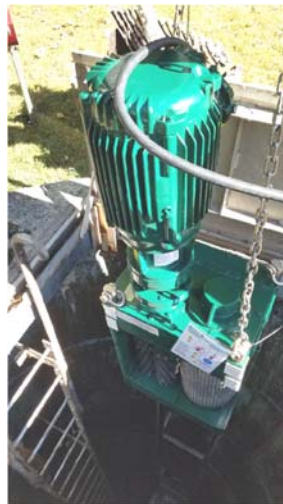
Channel Monster being lowered into West Main Street pump station

The other major improvement was the installation of a Channel Monster at the West Main Street pumping station. This unit utilizes rotating drums to capture solids in the channel and a dual-shafted sewer grinder to shred rags, rocks, wood and other trash into small pieces. Installation of this unit reduces the frequency of maintenance workers having to descend into the lower portion of the pump station to remove these solids.