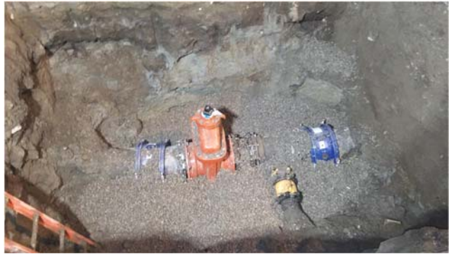
New water 14" gate installed

The other major improvement was the installation of a Channel Monster at the West Main Street pumping station. This unit utilizes rotating drums to capture solids in the channel and a dual-shafted sewer grinder to shred rags, rocks, wood and other trash into small pieces. Installation of this unit reduces the frequency of maintenance workers having to descend into the lower portion of the pump station to remove these solids.