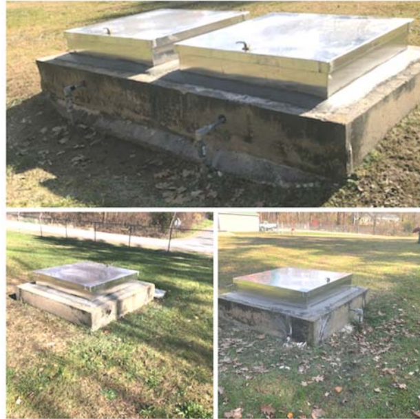
New access maintenance hatches at the Bible Hill reservoir

Water projects completed include the repair of water valves on Central and Butler Streets; replacement of access maintenance hatches at the Bible Hill reservoir and completion of system-wide hydrant painting.