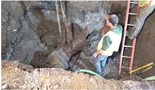
Removal of the old 14" water gate

Chief among these was the replacement of a gate-valve on the West Main Street 14" water main just west of the Church Street intersection. This work, completed at night, required detouring traffic around the work site and shutting off water service to much of the town. The commission thanks the users for their understanding and cooperation during this work.